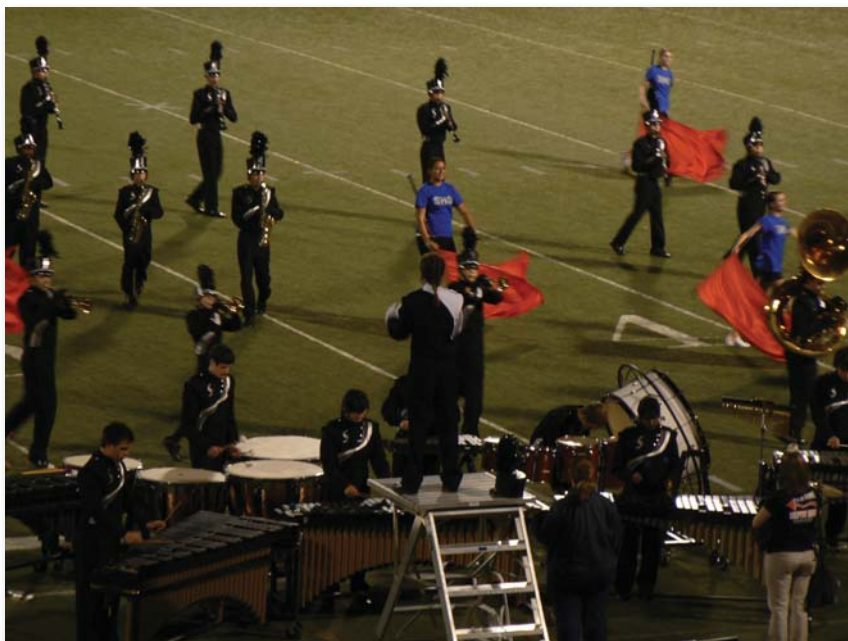
Shepton Band playing at Shepton vs Allen Football game Thursday, September 24 (10 grade football team).